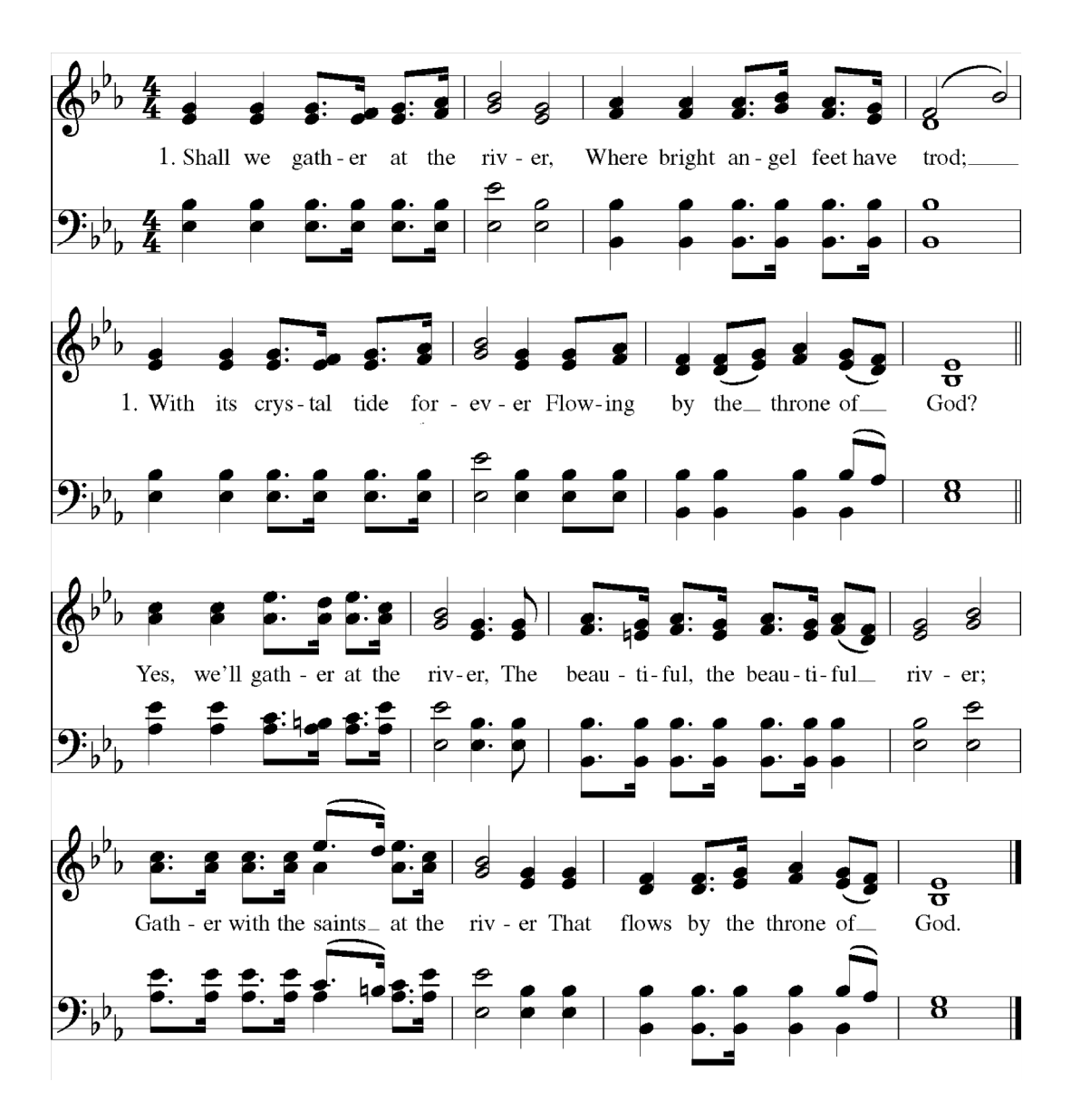
Hymn "Shall We Gather at the River"